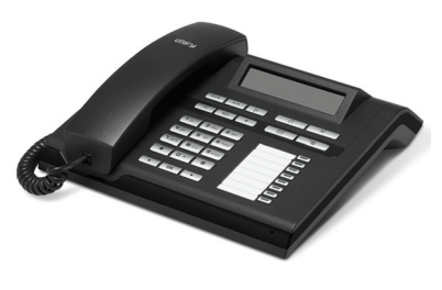
OpenStage 30 T